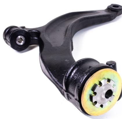
Figure 2 - Fitted